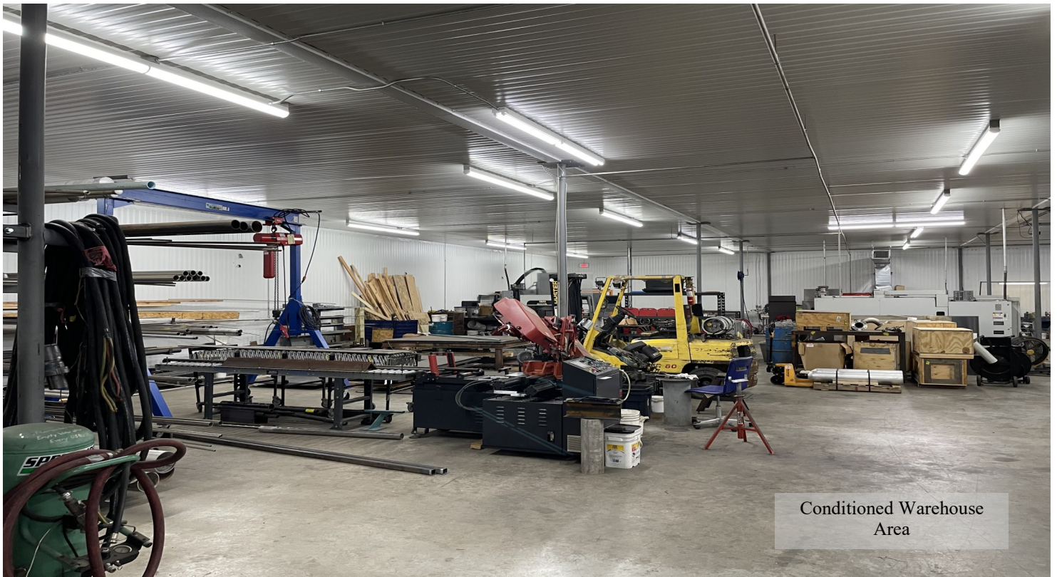
Conditioned Warehouse Area